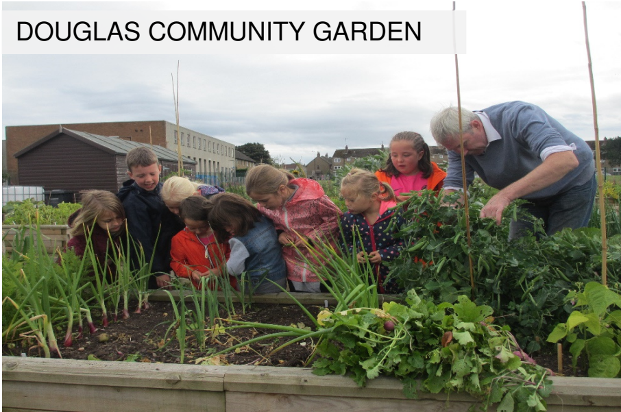
DOUGLAS COMMUNITY GARDEN