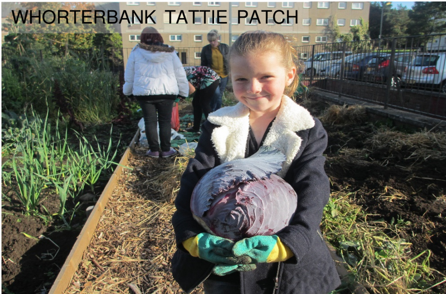
WHORTERBANK TATTIE PATCH