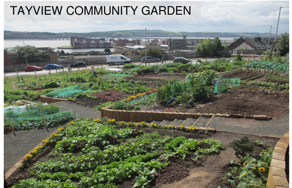
TAYVIEW COMMUNITY GARDEN