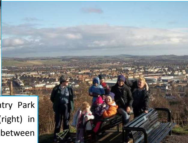
In Dundee, 14 groups have registered with It's Your Neighbourhood for 2017, they range from community gardening to wildlife groups.