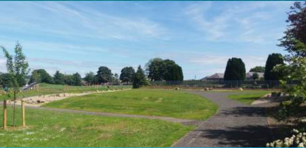
Fairmuir Park Landscape Improvements before (September 2016) and after (June 2017).