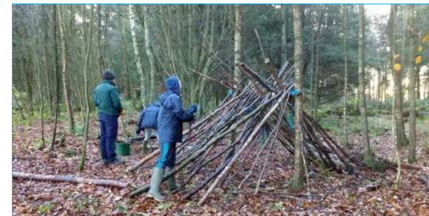
Baldragon Academy pupils gaining their John Muir Award with the Countryside Rangers. (March 17)

Neighbourhood Services are working with Zero Waste Scotland to develop a 'Community' LPAP for Dundee, which will be made up of individual LPAPs from businesses, groups and organisations across the city. The project aims to create a shared responsibility for litter prevention and a collective approach to tackling the issue.