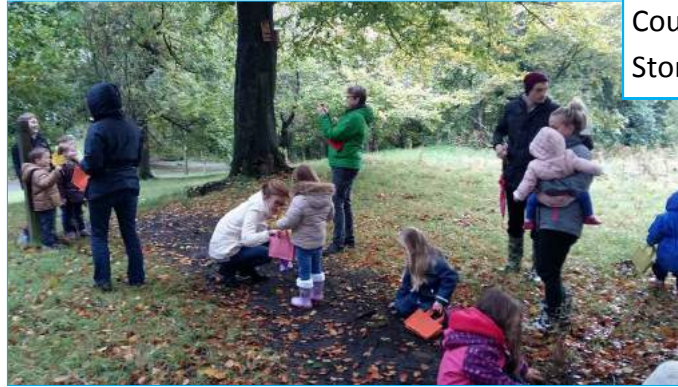
Countryside Rangers and Dundee Libraries Storytelling event at Balgay Hill. (October 2016)