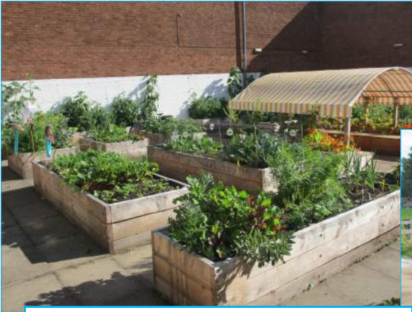
Douglas Community Garden (right) and Ardler Community Garden (above). (August 2016)