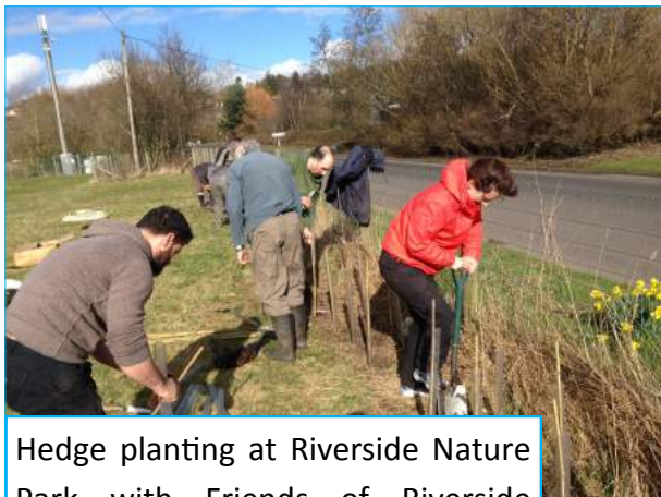
Hedge planting at Riverside Nature Park with Friends of Riverside Nature Park. (March 2017)