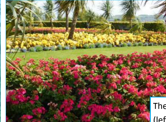
The Council's Seabraes bed (left) and East Marketgate (above) floral displays. (August 2016)

Bonnie Dundee worked with Rockwell School and the Overgate on an RHS 'Greening Grey Britain' project to create a calm garden for those who cannot cope with mainstream education. A grey space was dug by the Council's Community Payback Team then planted with seeds to attract pollinators and birds.