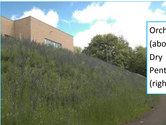
Orchids at the Stannergate (above), Harris Academy Dry Mix Perennial (left) and Pentland banking cornfield (right). (June 2017)