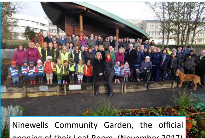
Ninewells Community Garden, the official opening of their Leaf Room. (November 2017)