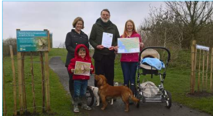
Promoting 'Dogs on Leads' at Riverside Nature Park to protect ground nesting birds. (March 2017)

In 2016 the campaign was extended to four years, during this time a number of initiatives will be united under the Take Pride banner with lots of opportunities for residents to get involved.