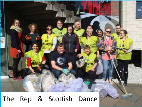
The Rep & Scottish Dance Theatre Litter Pick. (May 2017)

The Council has developed a reed bed area at Riverside to assist with sustainable disposal of post-collected street sweepings.