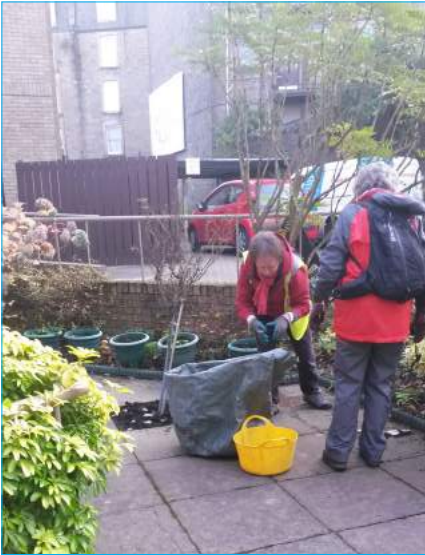
Bonnie Dundee bulb planting at Blackness Court Sheltered Housing (above) and crocus planting (right) at the Technology Park. (November 2016)