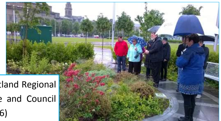
Keep Scotland Beautiful held a Beautiful Scotland Regional Advice Seminar in Dundee. Bonnie Dundee and Council Officers provided an example tour. (June 2016)