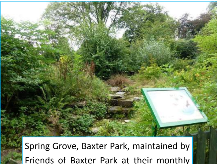
Spring Grove, Baxter Park, maintained by Friends of Baxter Park at their monthly volunteer sessions. (November 2016)

Dundee Flower & Food Festival is held annually at Camperdown Park over the first weekend in September. The three day extravaganza includes a large range of competitive classes, stunning displays of flowers (above), cookery demonstrations, live music, children's activities and much more. Dundee's schools get involved too, school bands provide the musical entertainment on Friday and entries are encouraged into the Children's Classes. We are delighted to welcome the British Begonia Society's 12 Board Championship for 2017. (photos September 2016)