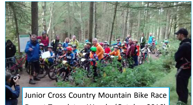
Junior Cross Country Mountain Bike Race Day at Templeton Woods. (October 2016)