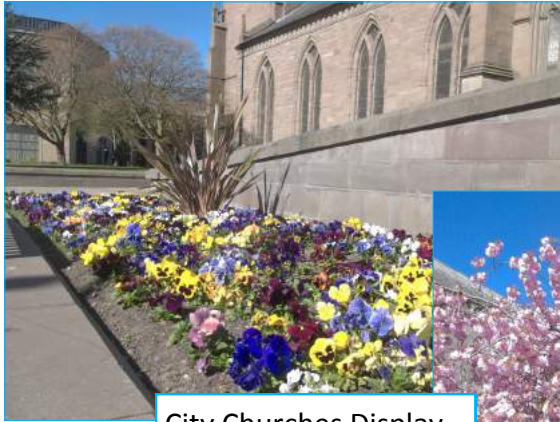
City Churches Display. (February 2017)