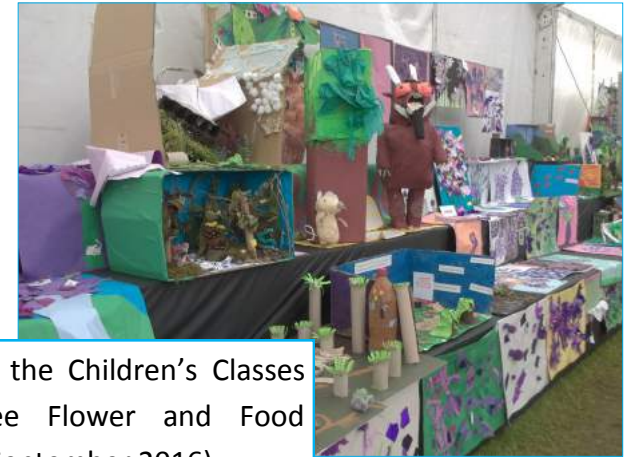
Entries to the Children's Classes at Dundee Flower and Food Festival. (September 2016)