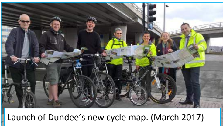
Launch of Dundee's new cycle map. (March 2017)

All Council schools have been offered additional resources to increase recycling of food waste. There was an encouraging response to this offer and we continue to provide communications support to schools to promote and embed the 'reduce, reuse, recycle' message.