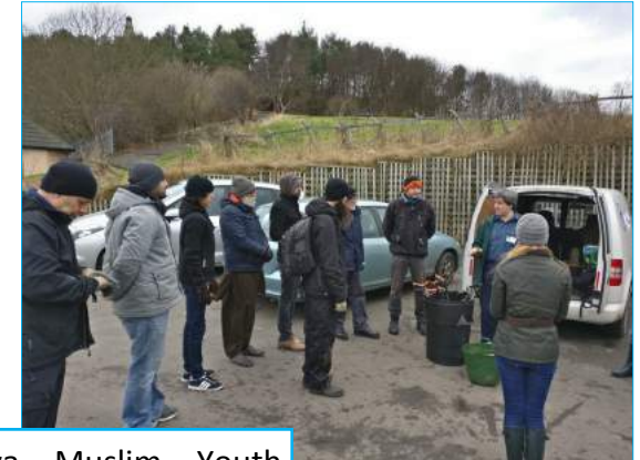
Ahmadiyya Muslim Youth Association and Friends of Dundee Law litter pick the Law (February 2017)