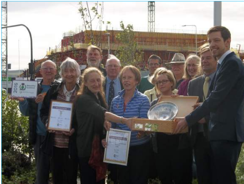
Community groups from across Dundee gather at Slessor Gardens to celebrate being awarded the Silver Gilt medal and Community Involvement Award (below) in Beautiful Scotland 2016. (September 2016)

We hope you enjoy our portfolio which shows a sample of the many projects and groups working to make Dundee a brighter, greener and cleaner place to live, work and visit.