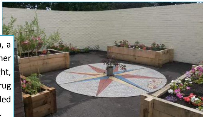
Addaction and Signpost International Garden, a memorial garden for quiet reflection (Summer 2017). A grey area was turned into a bright, safe, quiet space for families affected by drug or alcohol addiction. Bonnie Dundee provided advice to help get the garden up and running.