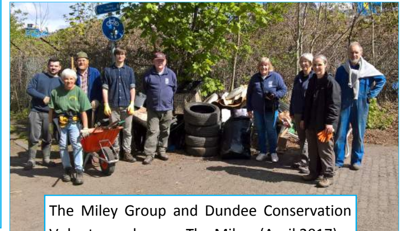
The Miley Group and Dundee Conservation Volunteers clean up The Miley. (April 2017)

Dundee is committed to tackling the challenges climate change will present to the local area. Reducing our greenhouse gas emissions ahead of national targets, adapting to the effects of climate change and re-asserting our low carbon credentials marks the next phase in the transition to a low carbon future.