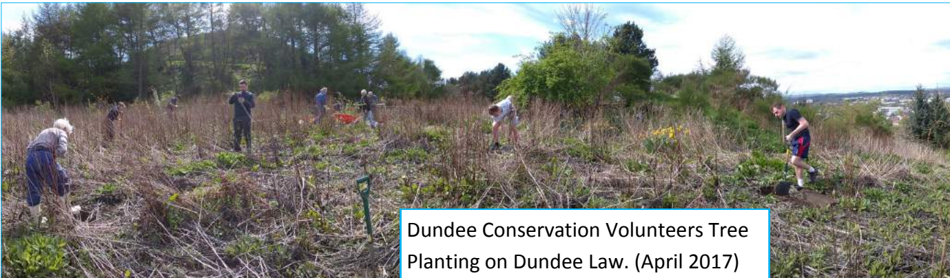
Dundee Conservation Volunteers Tree Planting on Dundee Law. (April 2017)