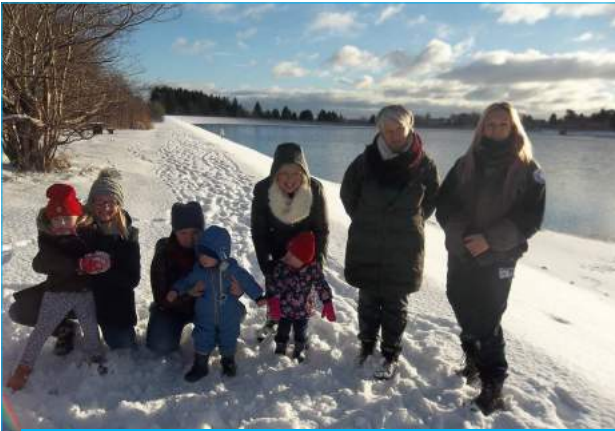
The Family Fresh Air Club at Clatto Country Park above (January 2017) and Dundee Law, (right) in February 2017. The Club is a collaboration between the Countryside Rangers, Community Development and Scottish Natural Heritage to run fun and inclusive outdoor activities in different learning environments around Dundee, a great use of our open spaces.