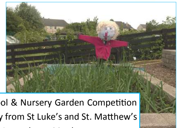
School & Nursery Garden Competition entry from St Luke's and St. Matthew's RC Primary (June 2017)