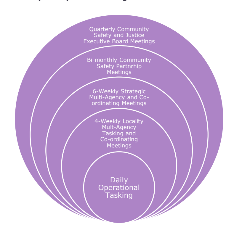
Figure 3 Dundee Community Safety Co-ordinating Structure