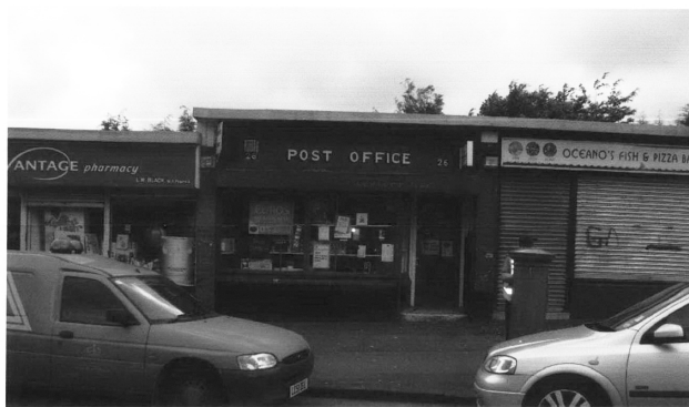
Street scape looking to ATM Location

The letter of objection from the local resident raises issues of car parking, congestion of the road and the impact on local residents. As noted above, it is clear that these local shops are busy and serve the local community. As habits have changed, residents now tend to drive to such