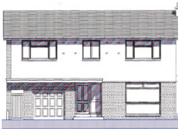
Proposed East Elevation

There are no non statutory Council policies relevant to the determination of this application.