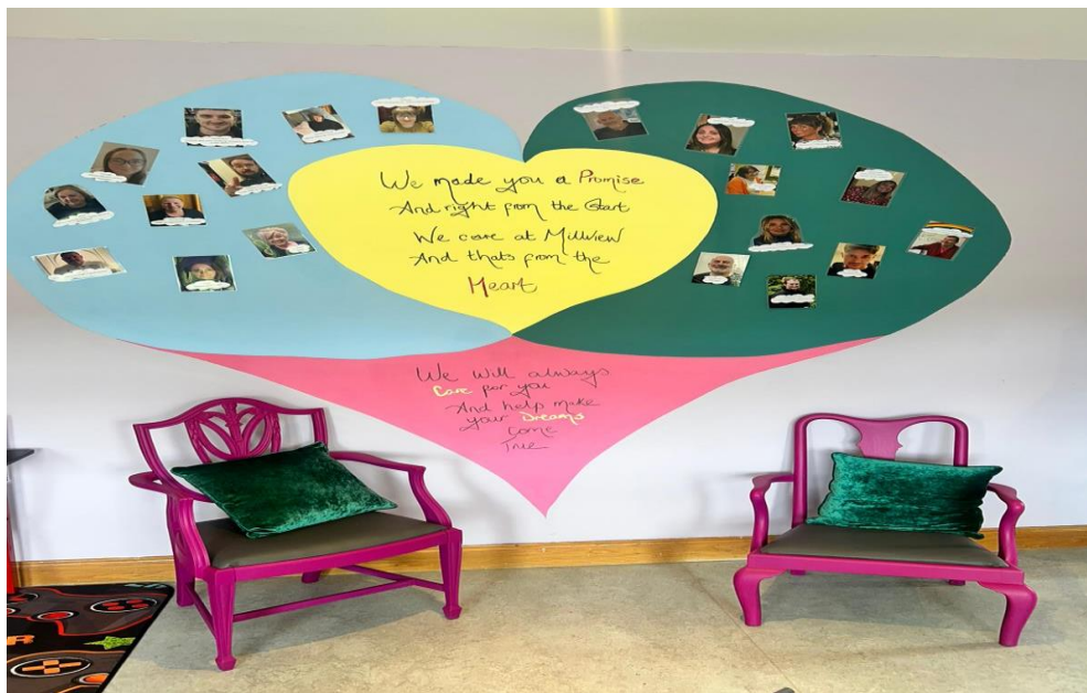
Millview Cottage, commitment to 'The Promise'

At Fairbairn House, the team was not inspected but they have now moved to the newly opened Craigie Cottage, which will support a younger group of children aged 6 to 12 years. The accommodation at Fairbairn House is also being retained and re-provisioned as a supported housing facility for young people seeking to leave care and requiring structured support.