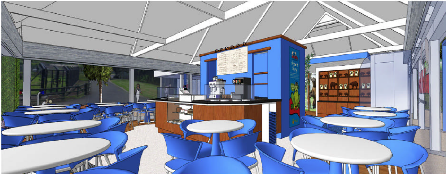
View from inside Cafe