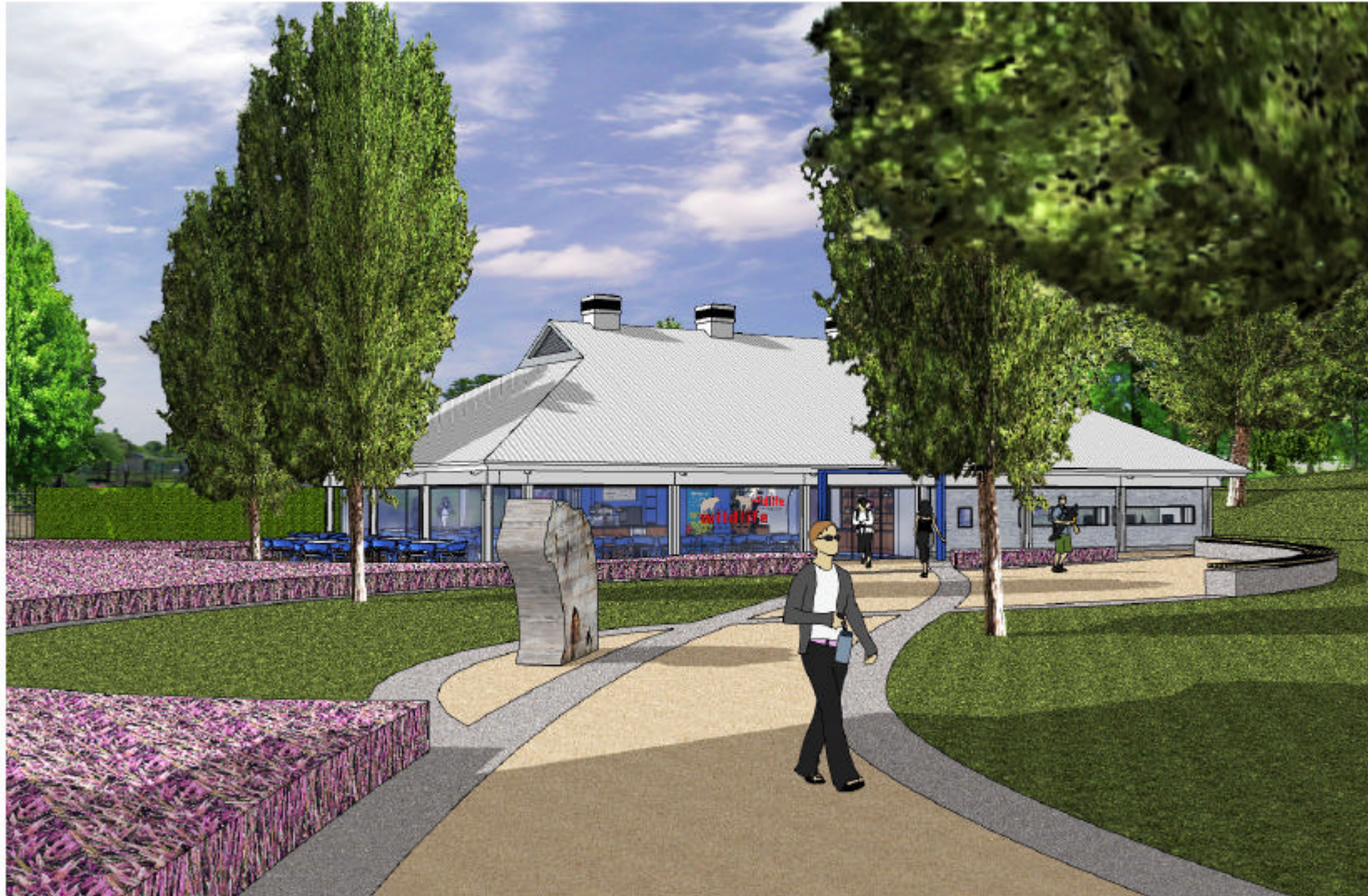
Approach from Car Park