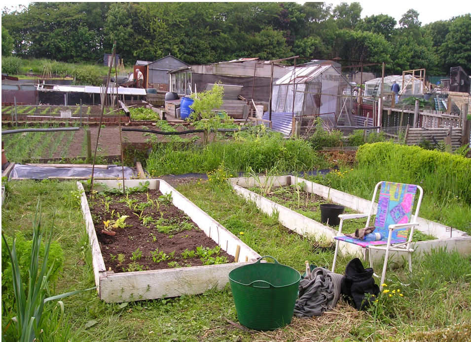
Looking up the Law from Stirling Park

Provide and promote allotment plots to organisations that work with the vulnerable or disadvantaged individuals to develop vocational, inter personal skills, healthier lifestyles and wellbeing.