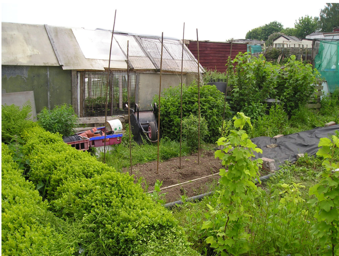
Bean poles, late spring, Stirling Park