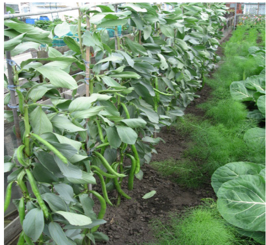
Clepington Garden Allotment