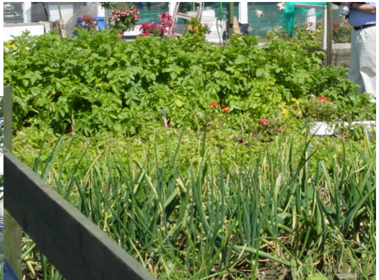
Old Craigie Road Allotments