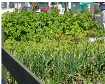
City Road Allotment