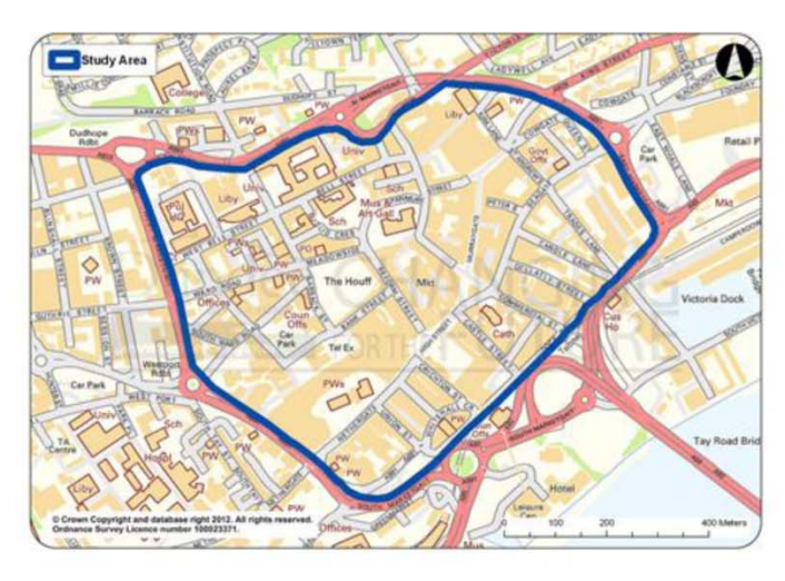
Figure 2 Dundee Central Area

All kerbside road space in the central area is regulated by means of Traffic Regulation Orders (TRO), drawn up by the City Council under the auspices of national legislation and is subject to enforcement by City Council-employed Parking Assistants. The TROs define the times that parking or loading/unloading are permitted or restricted and the types of vehicles that can park or load/unload there. These are backed up by traffic signs and lines to guide and inform motorists.