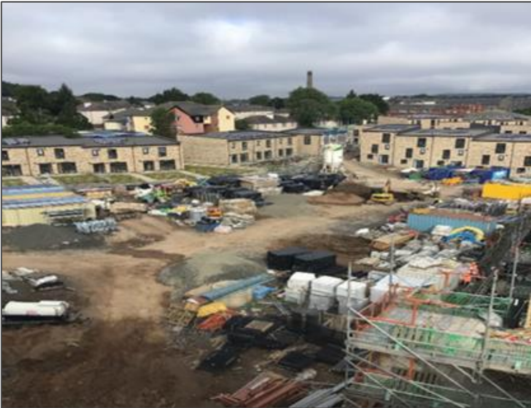
Hillcrest HA & Dundee City Council: Ongoing development at Derby Street