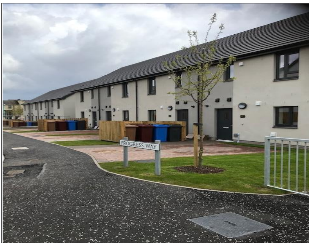
Caledonia HA: Former I.B. Connex site Maxwelltown