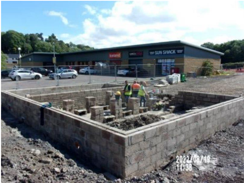
Home Housing Association – Haddington Avenue