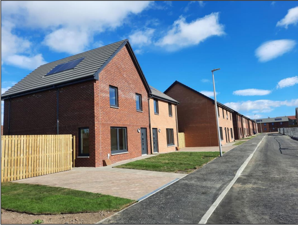
Abertay HA: Former Charleston Primary School