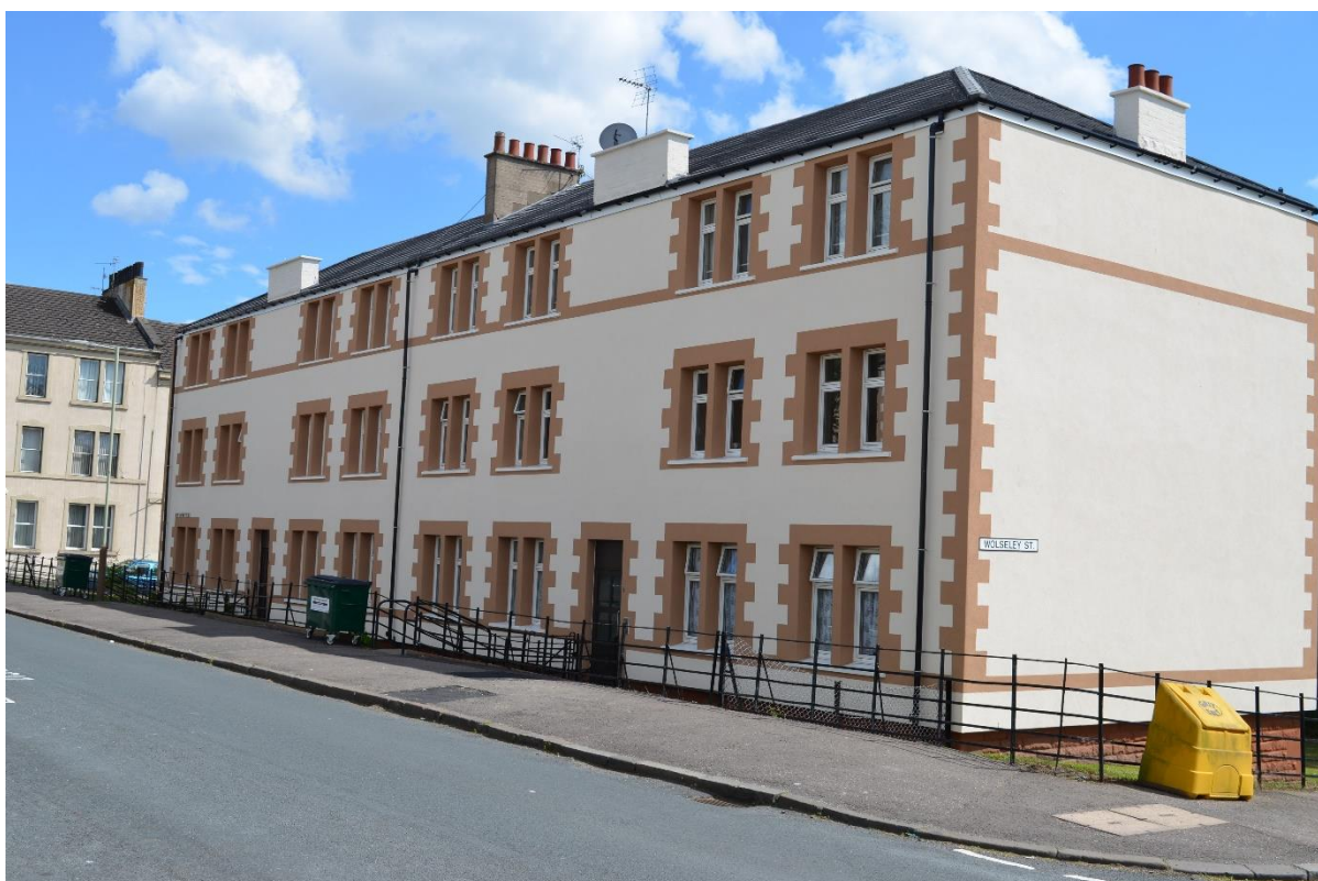
Example of External Insulation

Up until now, there has been no regulation of energy efficiency in the Private Rented Sector. However, this is expected to change later this year when the Scottish Government introduces legislation which means that from 1 st April, 2019, only privately rented properties that have an EPC Band of at least E (i.e. minimum rating of 39) can be let (with backstop date for all properties not re-let in the interim to achieve D being 31 st March, 2022). The standard will then be stepped up so that only those dwellings with an EPC Band of at least D (i.e. minimum rating of 55) can be let from 1st April, 2022 onwards (with backstop date for all properties not re-let in the interim to achieve D being 31 st March, 2025). A further proposal is that all privately rented properties achieve at least a Band C (minimum rating of 69) by 2030. The ongoing monitoring role for this new regime is expected to be carried out by Local Authorities but so far there have been no details about the resources which will be made available for this work.