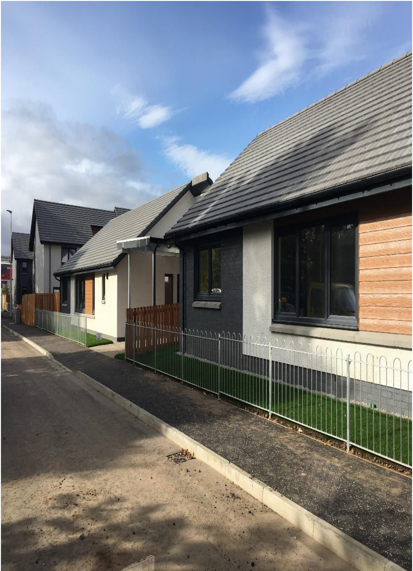
New Build Wheelchair Housing Alexander Street