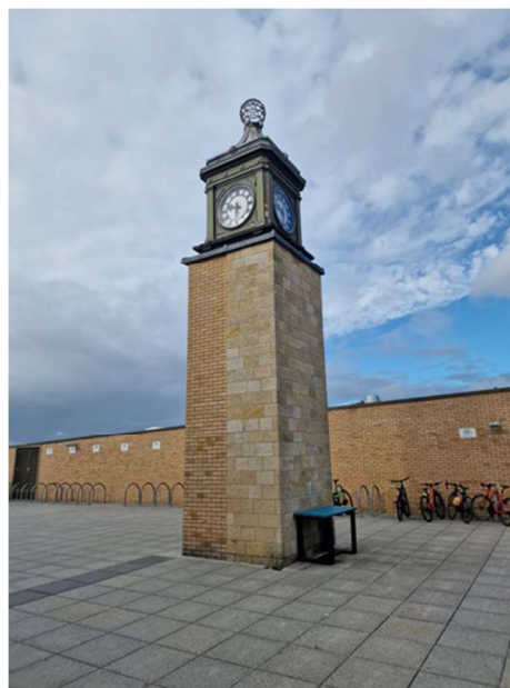
Harris Clock Tower