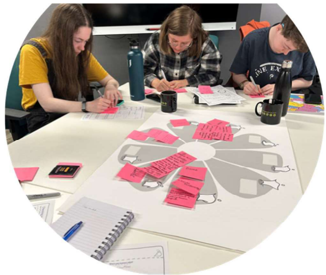
Elevator Academic Accelerator 2023