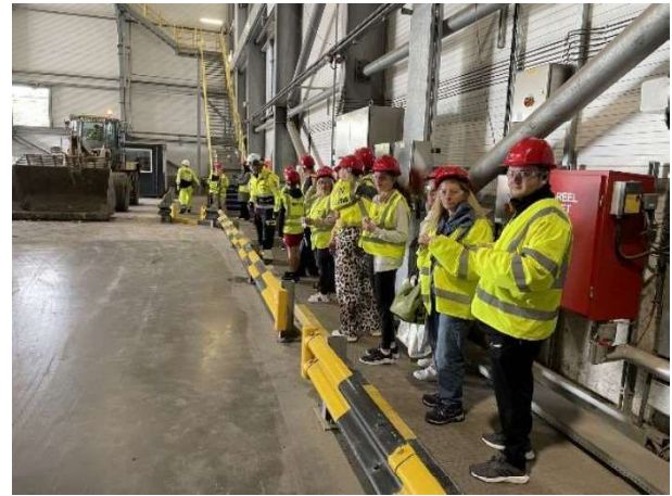
MVV Energy from Waste Plant Contractor

As part of the 25-year contract with Dundee City Council, MVV deliver a full community benefits programme. In the period April 2023 to March 2024, MVV delivered £1,682,075 of contract value to local subcontractors in Dundee and Angus, created 2 new employment opportunities including 1 apprenticeship, delivered 30 hours of business mentoring and delivered 2 work experience placements. They also delivered an extensive programme of awareness raising programmes activities delivering 25 sessions which supported 533 individuals and 12 environmental activities with supported 375 individuals. Some examples of this include their annual Open Day, allowing members of the public to tour the plant and undertake STEM activities. This year's event had more than 100 members of the community attending, a 50% increase on the previous year. MVV also deliver a range of programmes with Primary schools including their STEM Zip Line Challenge. This educational experience is delivered to secondary and primary schools. Primary 4 - Primary 7 were giving a Zip Line Challenge this year. This is a useful Engineering activity, the young people are asked to work in a group and communicate in a team, they design, using the materials given, build and then test their model on the line. This is an inspiring fun and competitive activity that always has young people fully engaged.