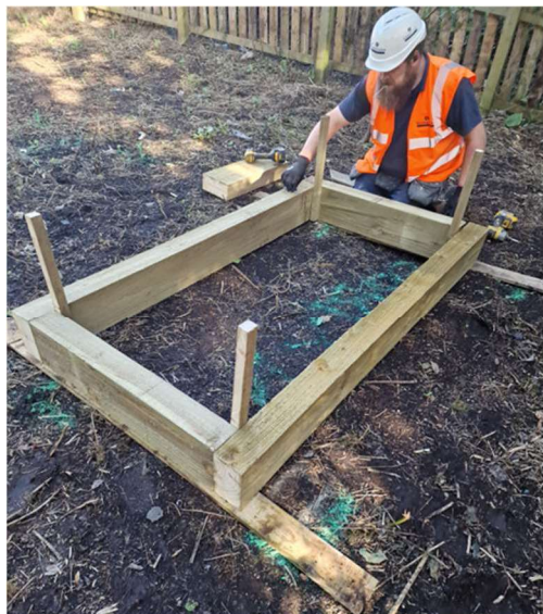
Harris Academy Eco Garden

As part of their Community Wish commitment Robertsons received a request to restore the clock tower which is located in Harris Academy's courtyard. They completed this work by replacing the face and repainting the new wood surrounding the clock face to bring the iconic clock back into use. The Robertson Tayside Young Team of volunteers also supported staff to landscape a garden of the school, by removing overgrown weeds, replacing units in the green house and transforming the schools Eco- Garden. They also erected new colourful planters ready for spring planting. Both of these projects