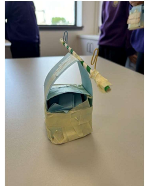
STEM Zip Line Challenge Models