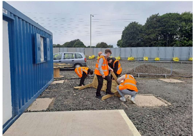
Helm and Barnardo's Construction Programme