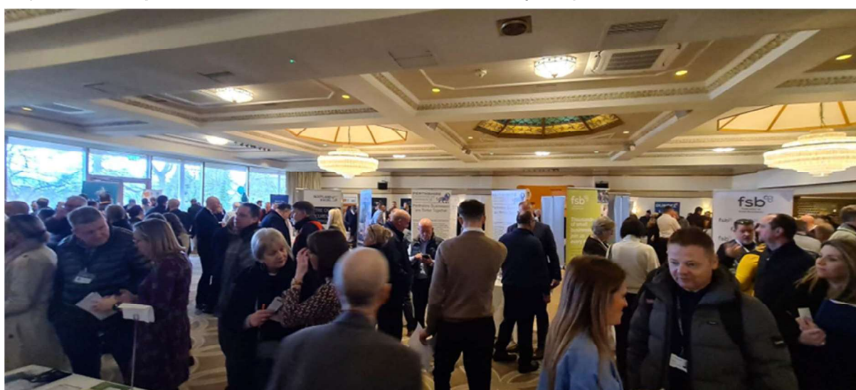
Meet The Buyer Tayside, 20th February 2024, Invercarse Hotel