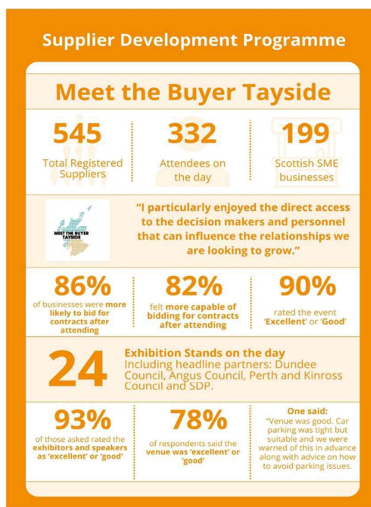
MTB 2024 - Event Statistics

The Corporate Procurement Team was grateful to with support from Economic development colleges and Supplier Development programme deliver another successful Meet the Buyer Tayside event on 20 February 2024. This was our most successful session to date with over 300 companies and 24 companies exhibiting. This free event gave suppliers in Tayside direct access to buyers and decision makers from across the public and private sector, helping suppliers raise their profile as a business, and prepare for upcoming contract opportunities. 82% of suppliers felt more capable of bidding for contracts after attending the Meet the Buyer Tayside 2024 and 86% of respondents said they were more likely to bid for contracts after attending the event. Comments from participants included “I particularly enjoyed the direct access to the decision makers and personnel that can influence the relationships we are looking to grow.” and “The buzz of the atmosphere was great, and the room was filled with very helpful exhibitors.”