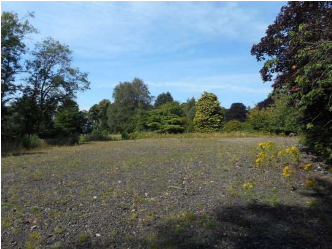
Figure 3 – Site Photo