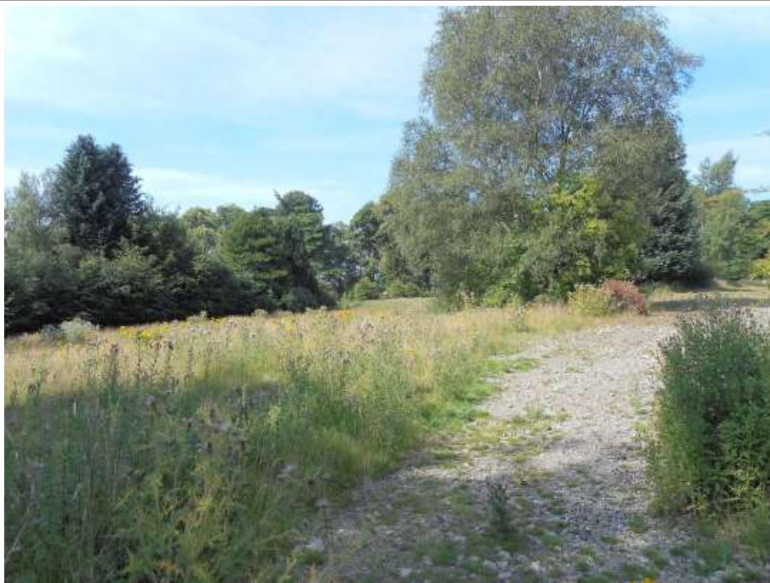
Figure 4 – Site Photo