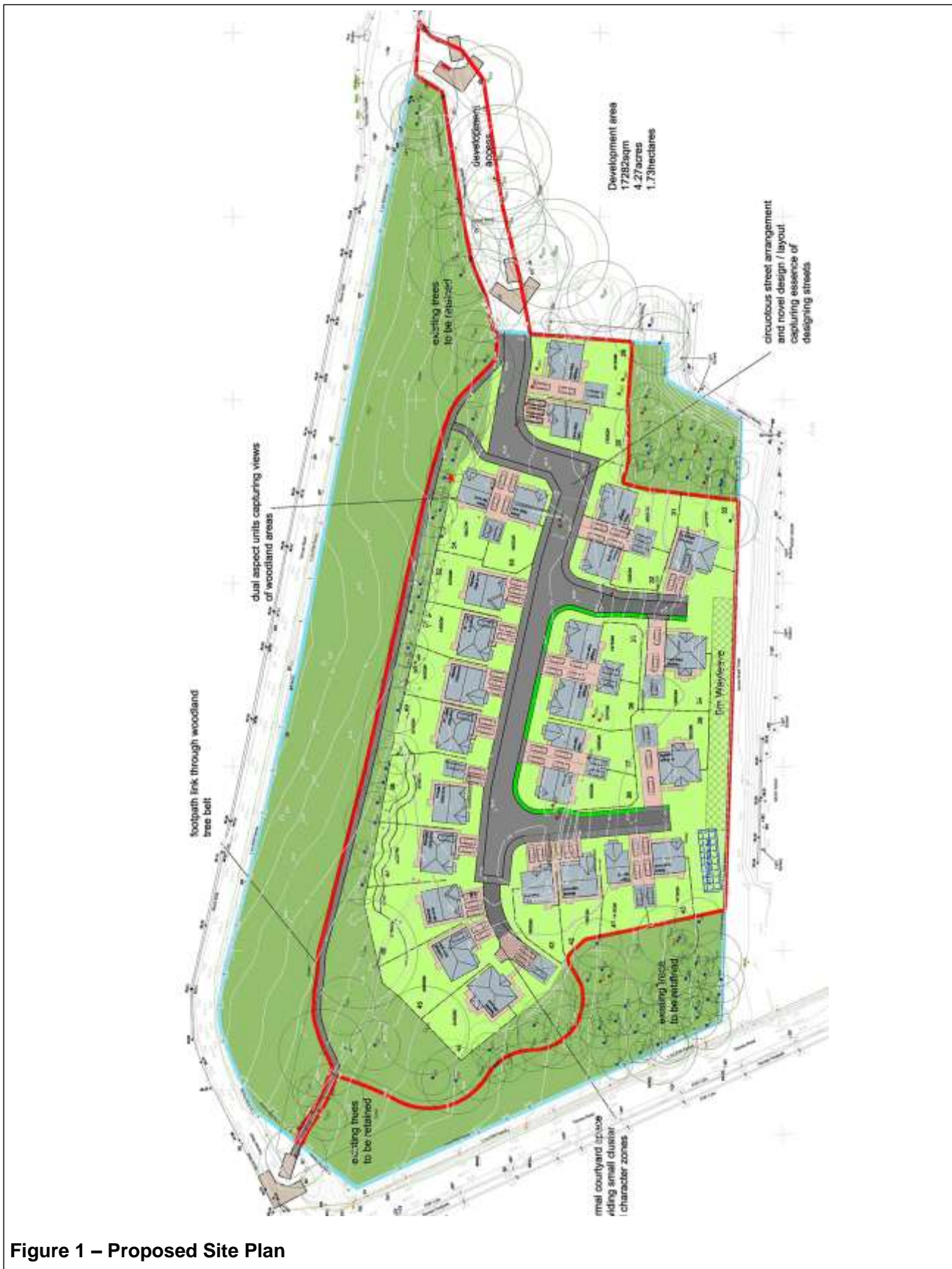
Figure 1 – Proposed Site Plan