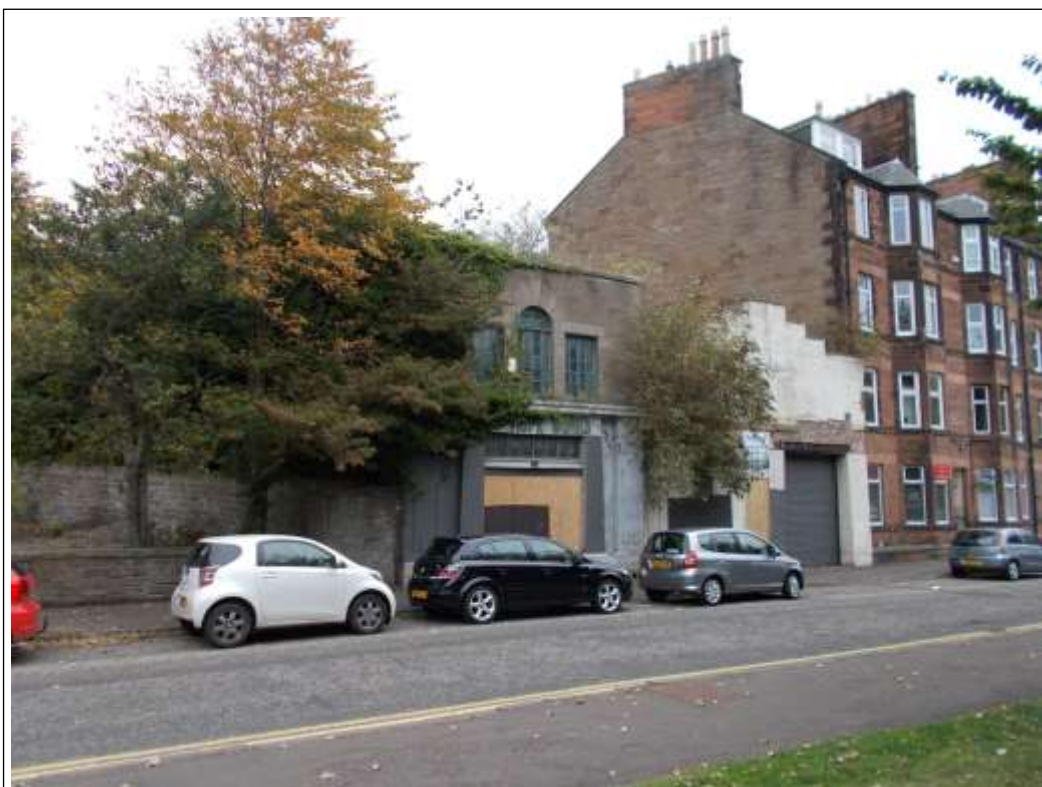
Figure 2 – Site Photo