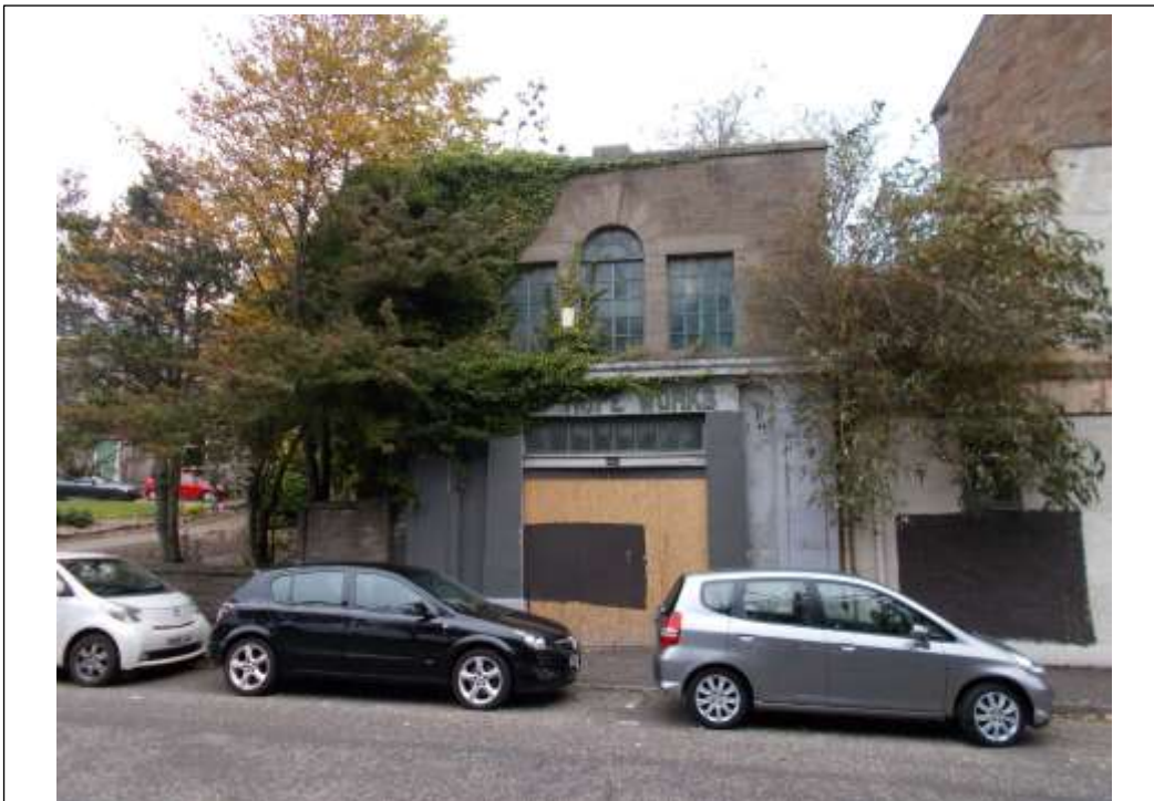
Figure 1 – Site Photo