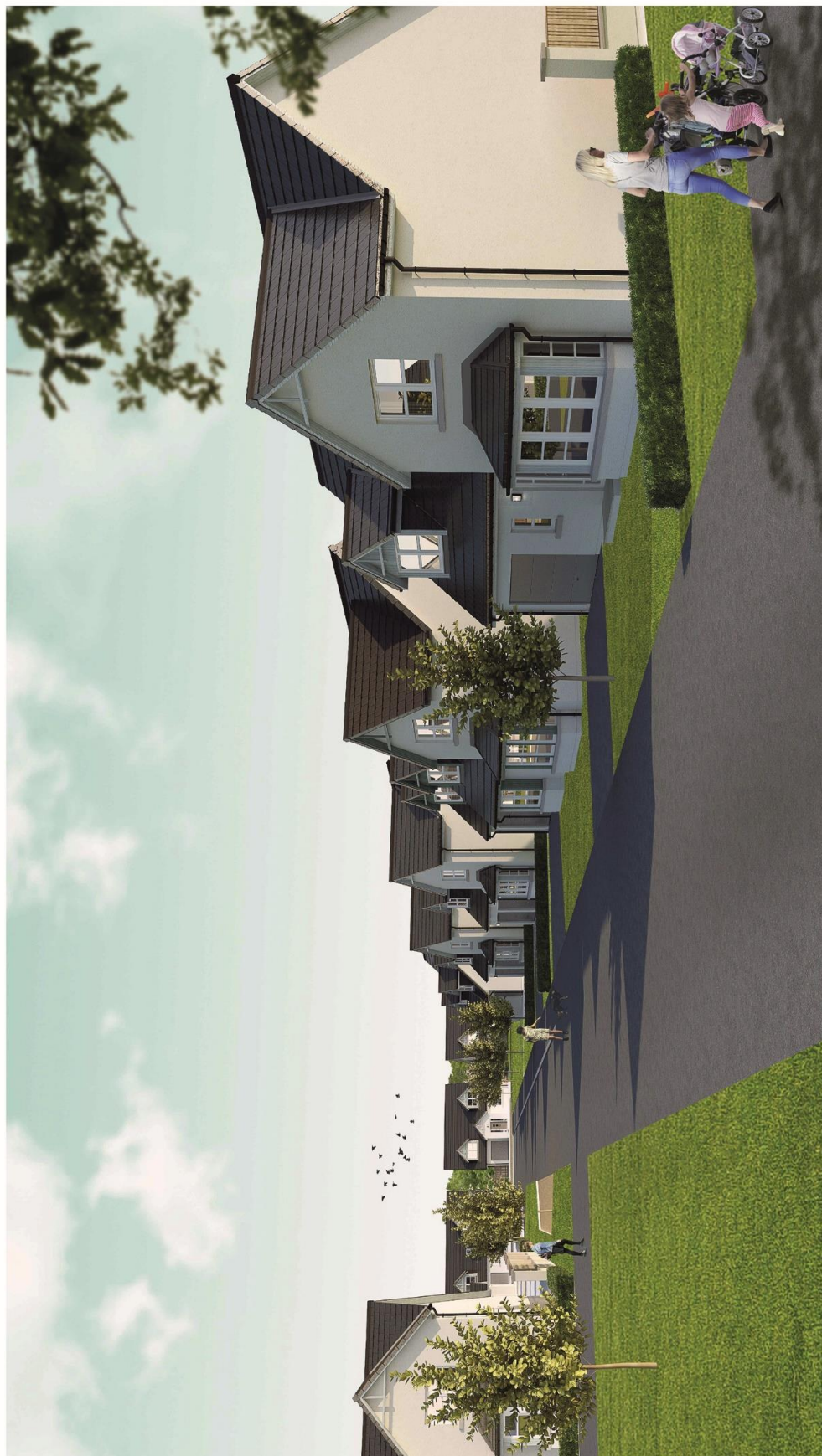
Broughty Ferry - Scene Along Tree Lined Avenue at North East of Site