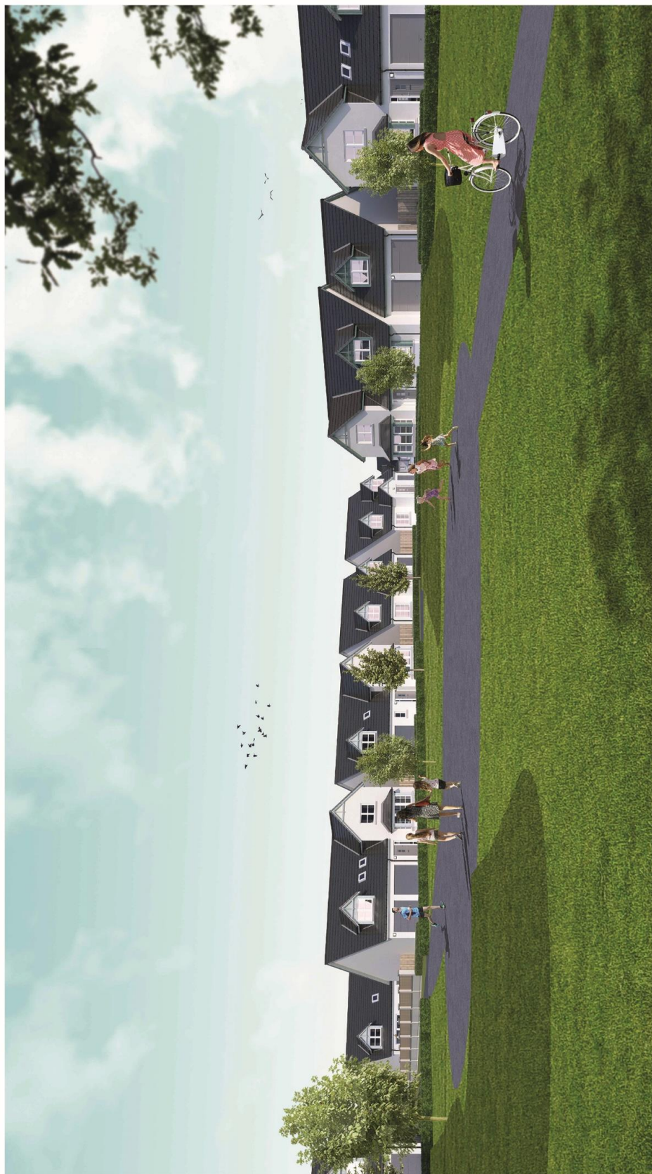
Broughty Ferry - Scene Across Central Open Space