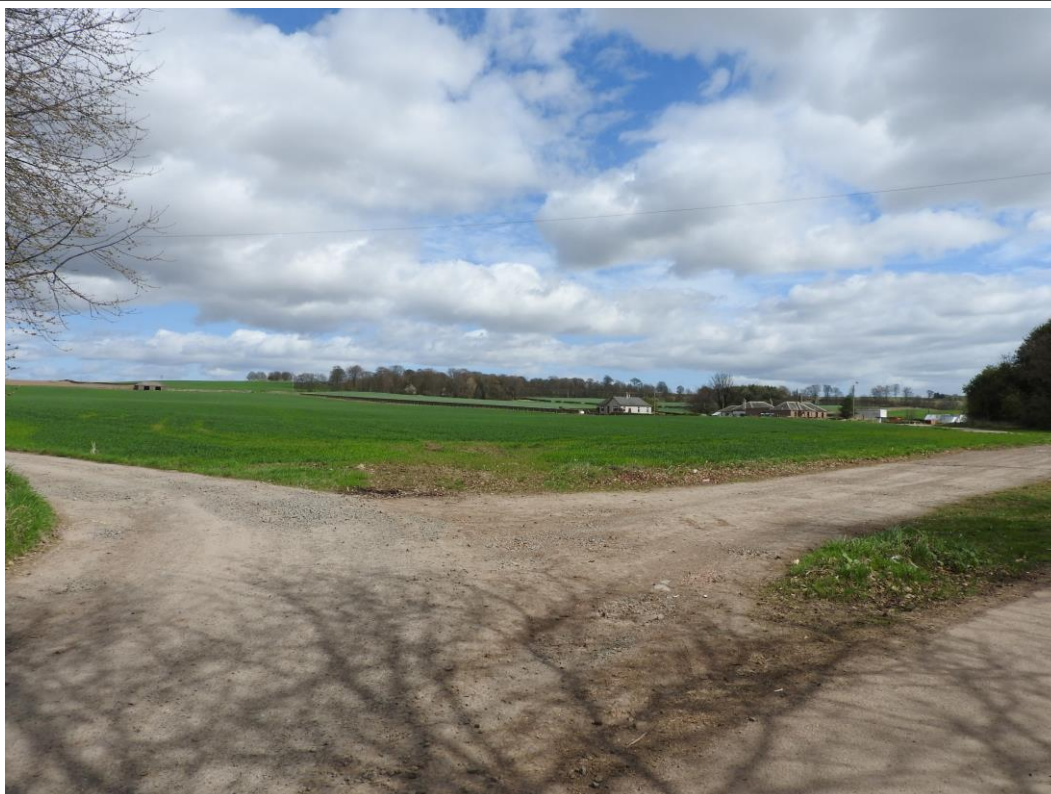
Figure 5 – Site Photo Towards North East