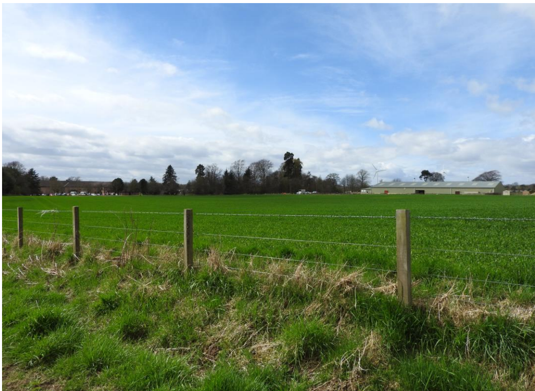
Figure 4 – Site Photo Towards South West