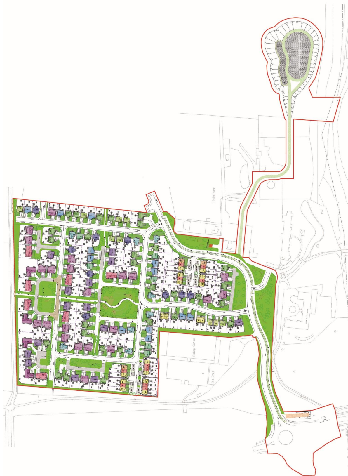
Figure 1 – Proposed Site Layout