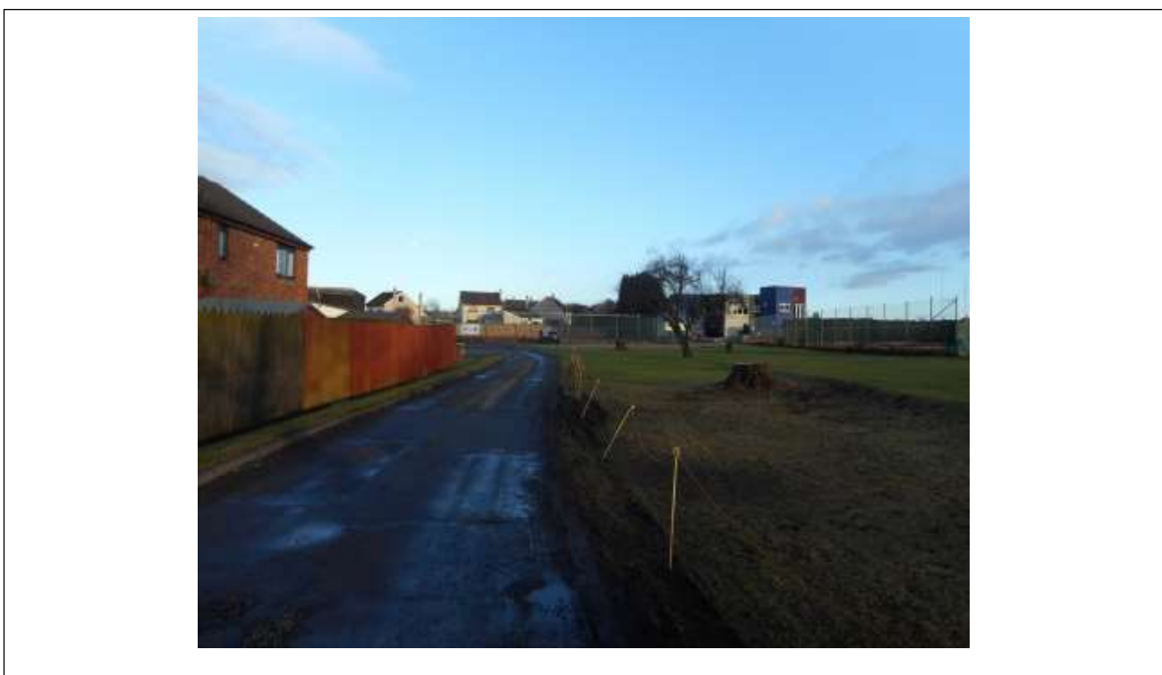
Figure 2 – Site Photo

2.1 The application site is located within Broughty Ferry at Forthill Sports Club grounds. More specifically the application site relates to three existing tennis courts to the immediate north of the clubhouse and south west of residential properties at Laxford Lane. The site is designated as open space as per the adopted Dundee Local Development Plan, 2014.