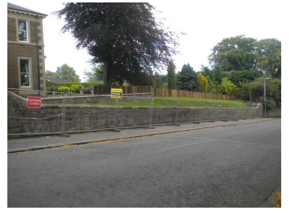
Figure 2 - Site Photo

2.1 The application site relates to the former Taychreggan hotel and is located within suburban Broughty Ferry and the West Ferry Conservation Area. The application relates more specifically to the western boundary wall, a former 2.285 metre high rubble stone boundary wall, extending along 42.5 metres of Ellieslea Road adjacent to the footway.