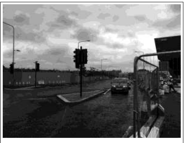
Figure 3 - Site Photo 2