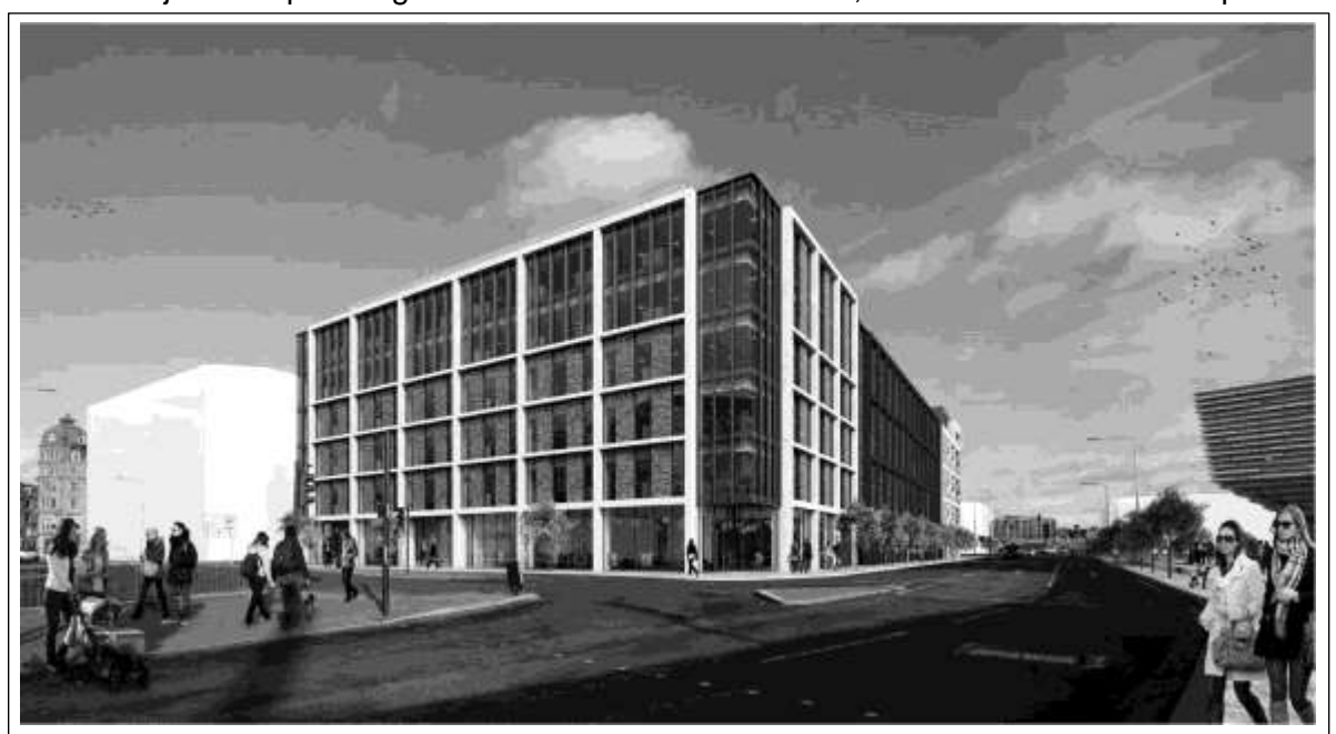
Figure 5 – Office Block 3D Image – View From Southwest