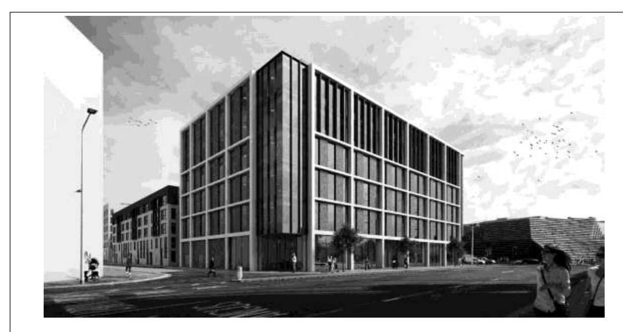
Figure 4 - Office Block 3D Image - View From Northwest