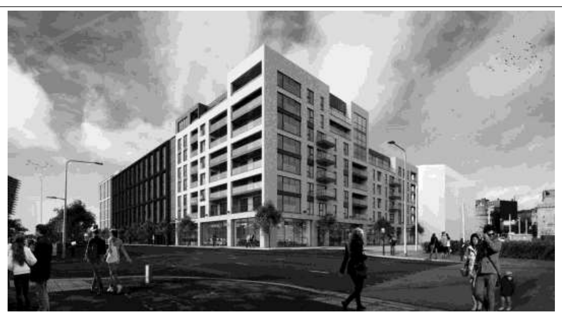
Figure 6 - Residential Block 3D Image