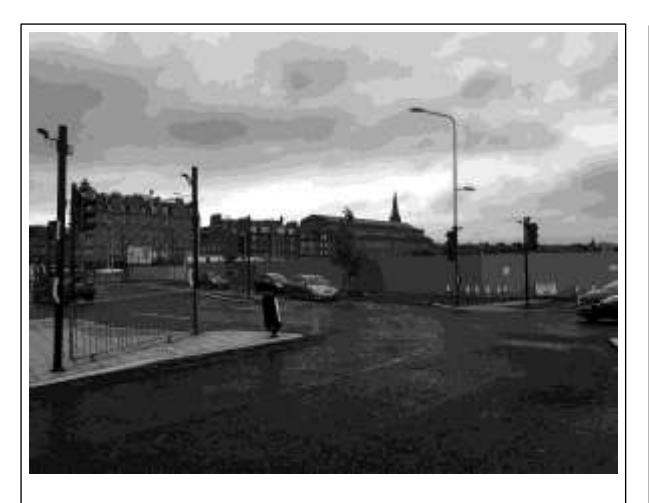
Figure 2 - Site Photo 1