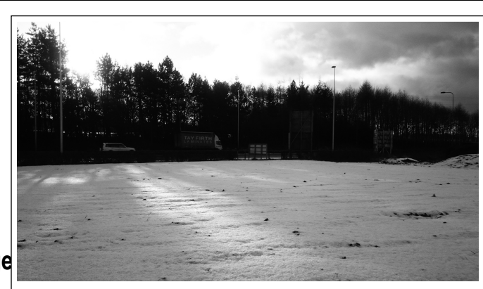
Figure 3 – Site Photo

2.1 The application site is located immediately north of the A90 Kingsway West, at Myrekirk Roundabout. The 577m² site forms part of a rectangular area of land immediately east of existing NCR offices and to the south of Fulton