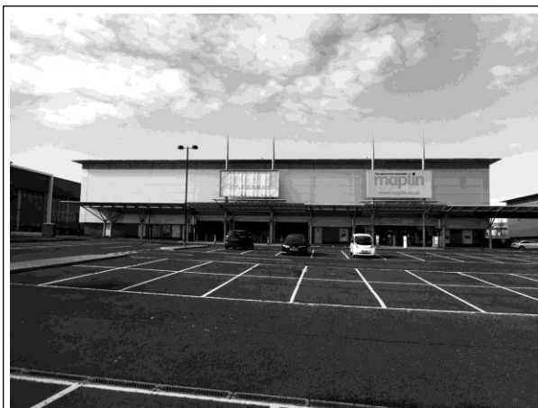
Figure 4 – Photo of Existing Unit From North East