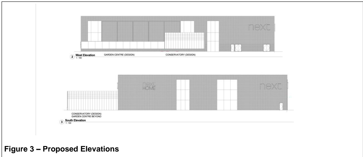
Figure 3 – Proposed Elevations