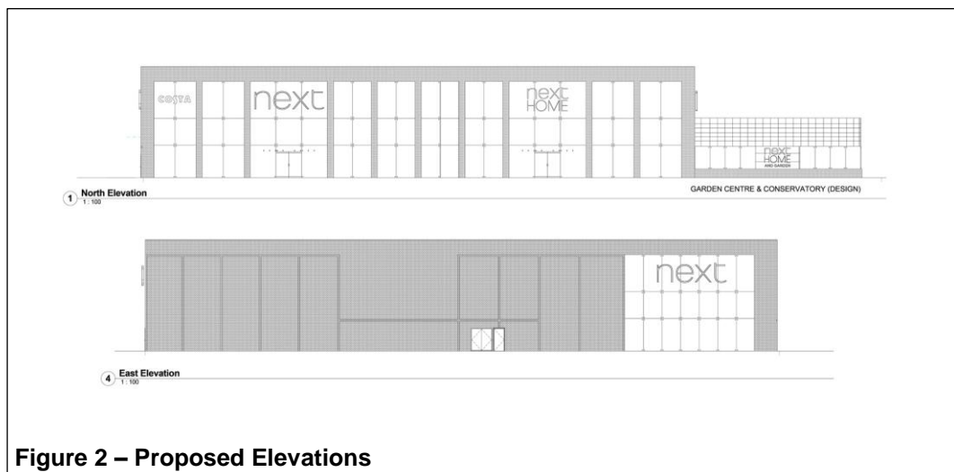
Figure 2 – Proposed Elevations