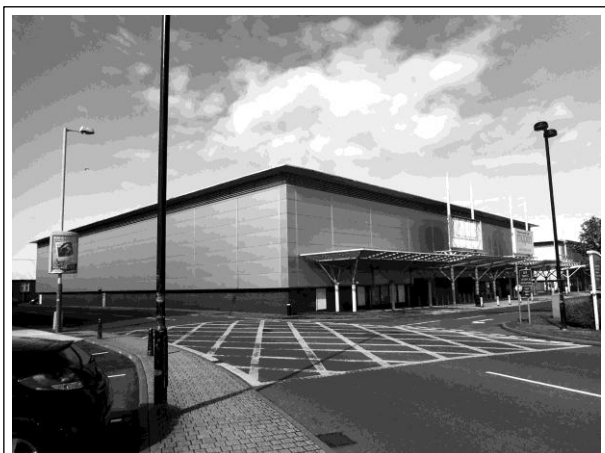
Figure 5 – Photo of Existing Unit and Access from Clepington Road