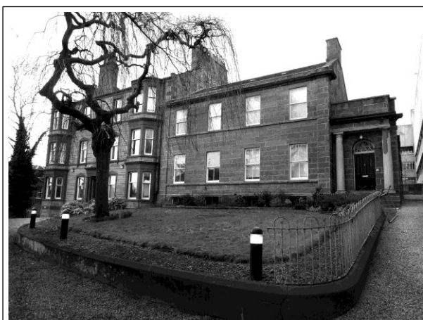
Figure 1 – Site Photograph