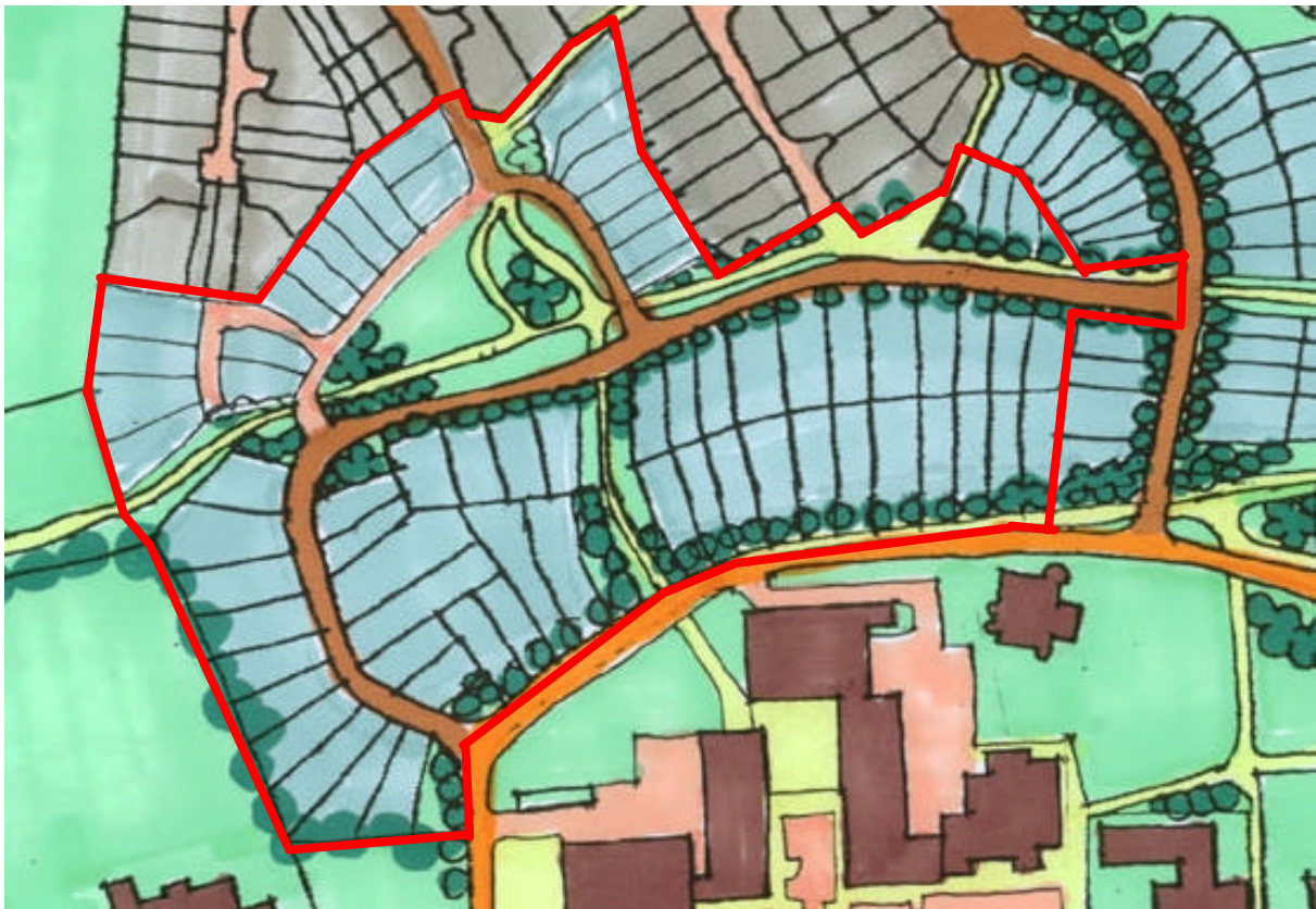
Whitfield Design Framework - extract indicating notional layout and circulation