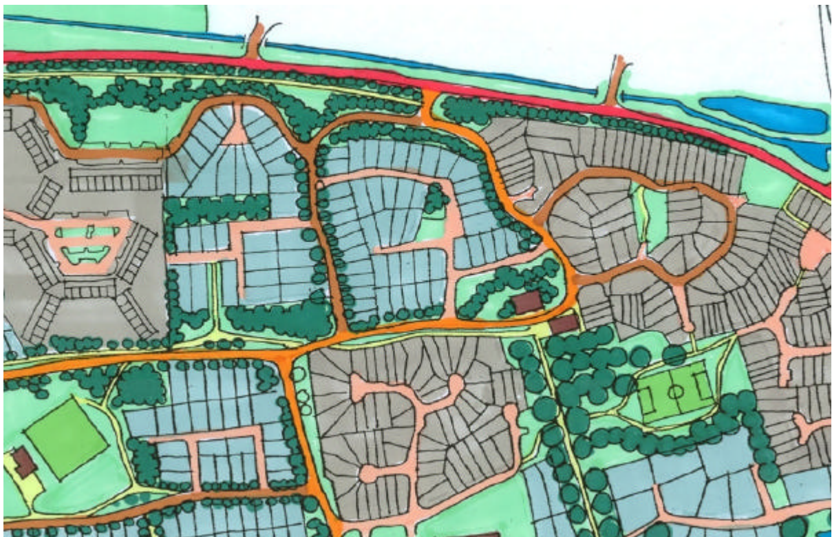
Aberlady Crescent - Whitfield Design Framework context