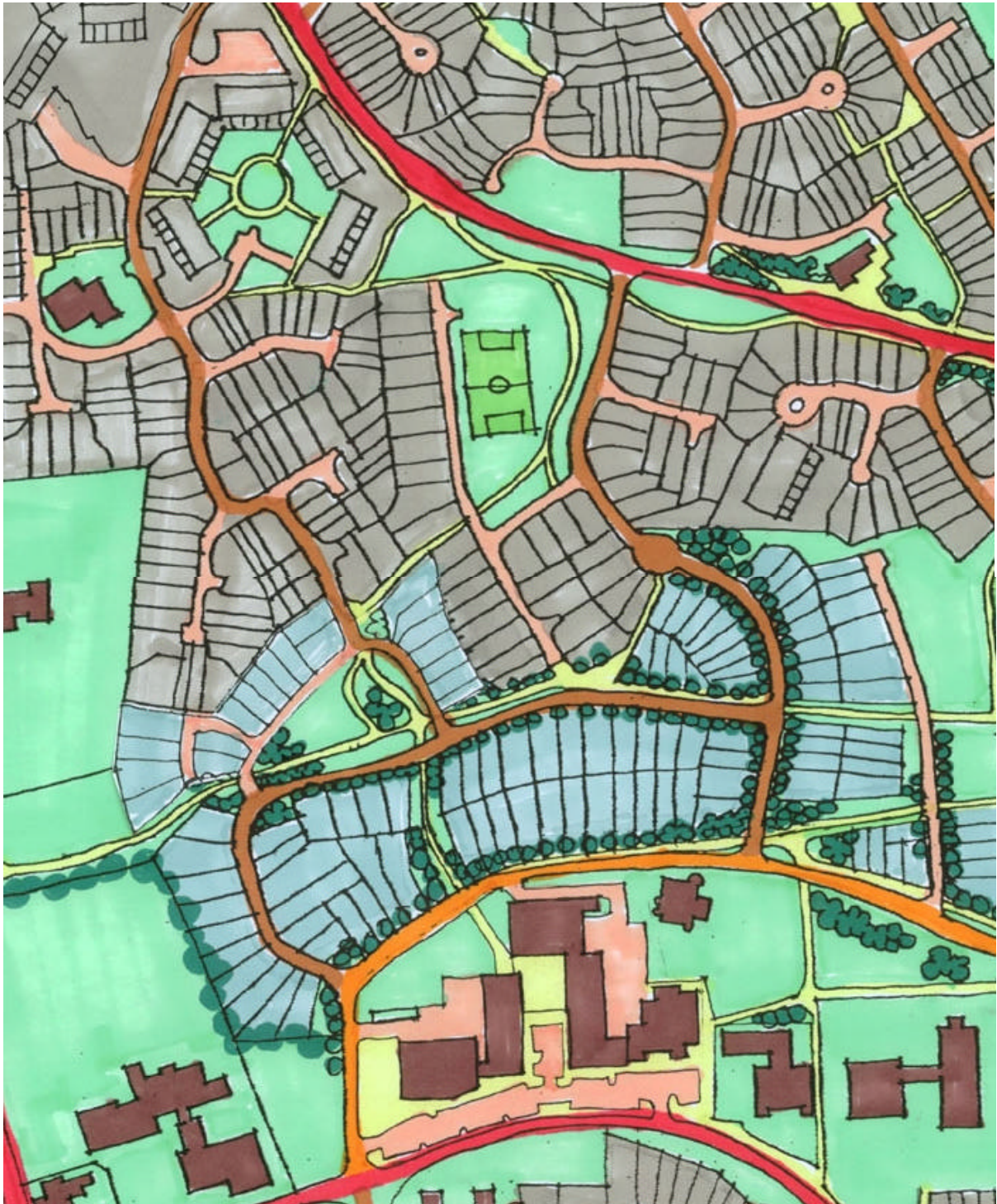
Whitfield Design Framework - extract indicating context