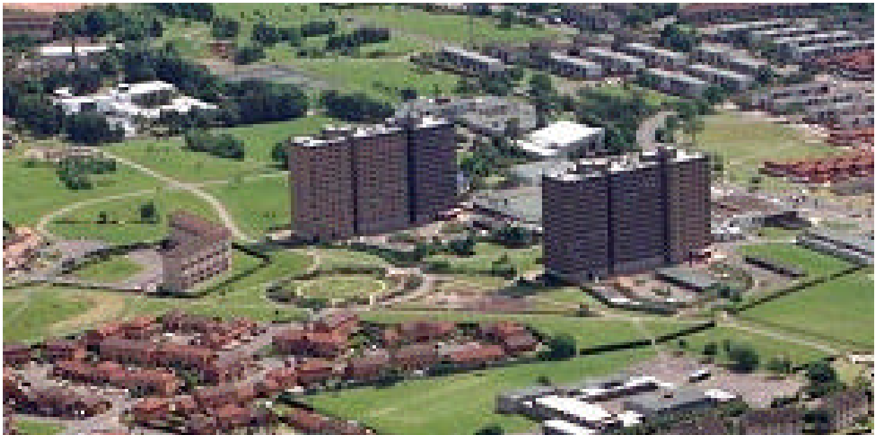
Aerial view of site