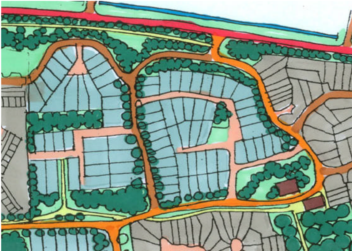
Aberlady Crescent - Whitfield Design Framework notional layout