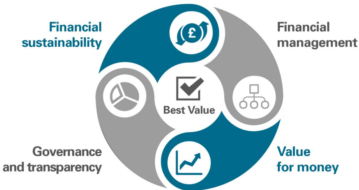
Exhibit 4 Audit dimensions

36. The four dimensions that frame our audit work are shown in Exhibit 4 .