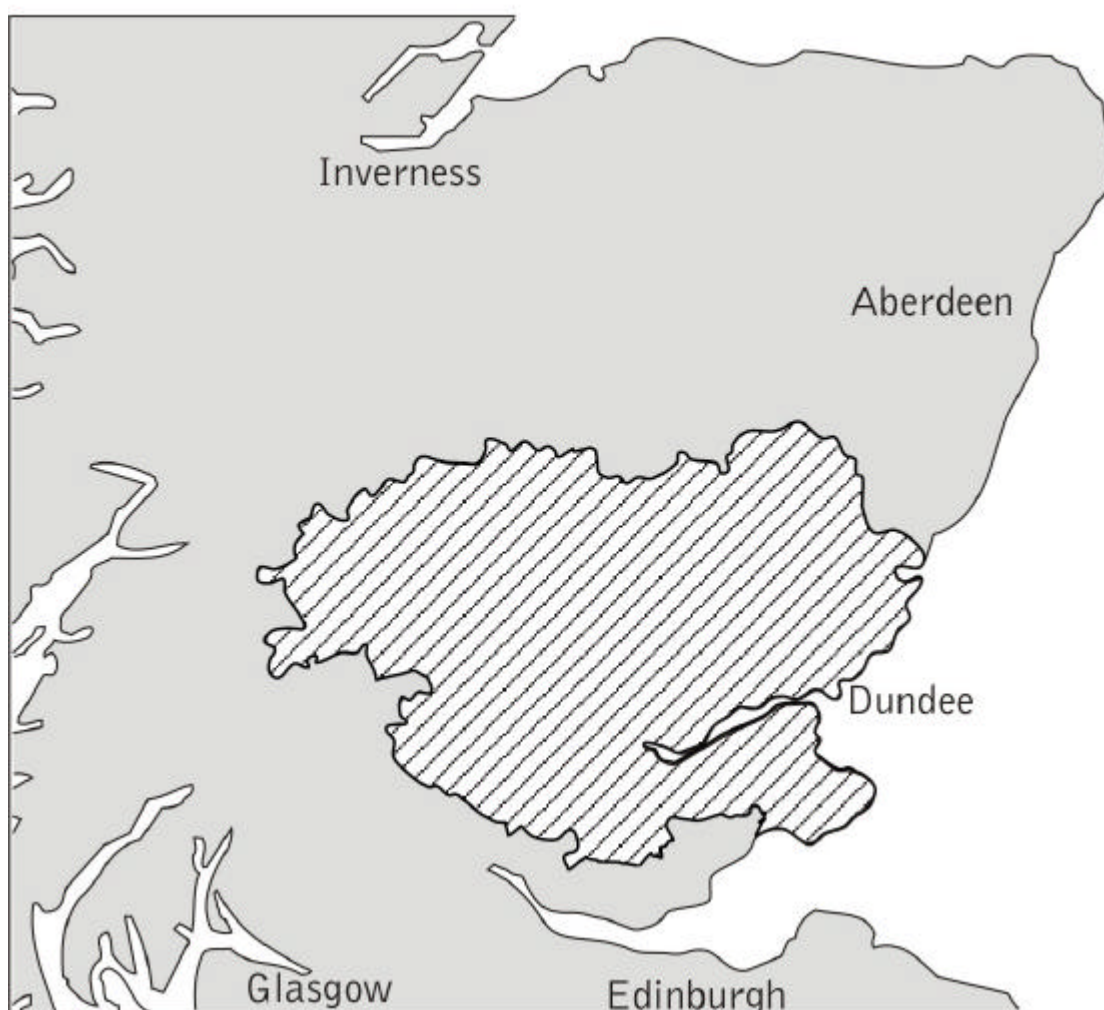
Map 1 : TAYplan Boundary (Approved 2008)