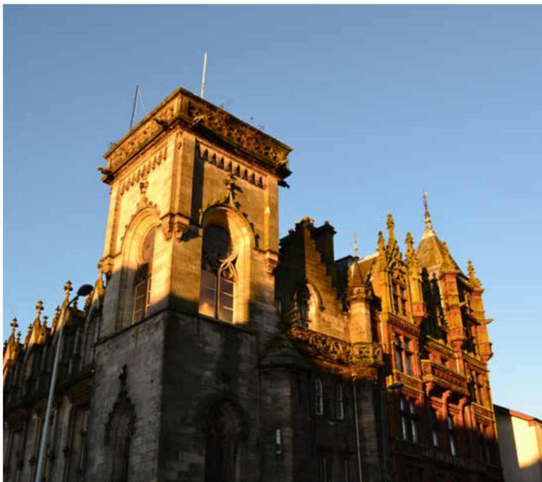
Location of Eaglais Ghaidhlig Dhun Deagh / Dundee Gaelic Church

Dundee City Council will compile an annual progress report that will be provided to Bòrd na Gàidhlig and made available to the public.